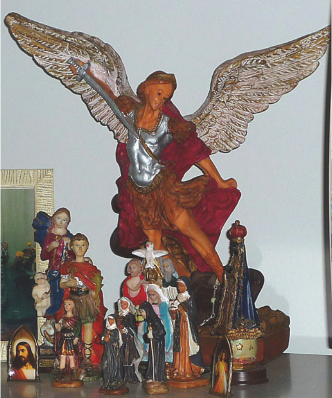
Mirassol—typical home worship centre