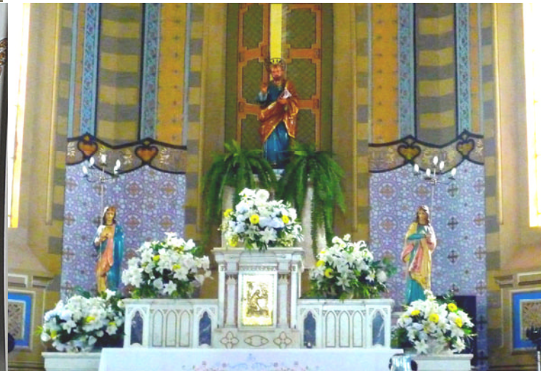
Mirassol—Main catholic church—St Peter dominates the front of the altar